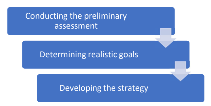
Figure 3. Three steps of the process of preparatory activities

The process of preparatory activities to reduce the amount of food waste consists of three steps, as illustrated in Figure 3. Based on the results of the preliminary assessment, we can determine realistic goals for our unit, which is a prerequisite for developing the strategy.