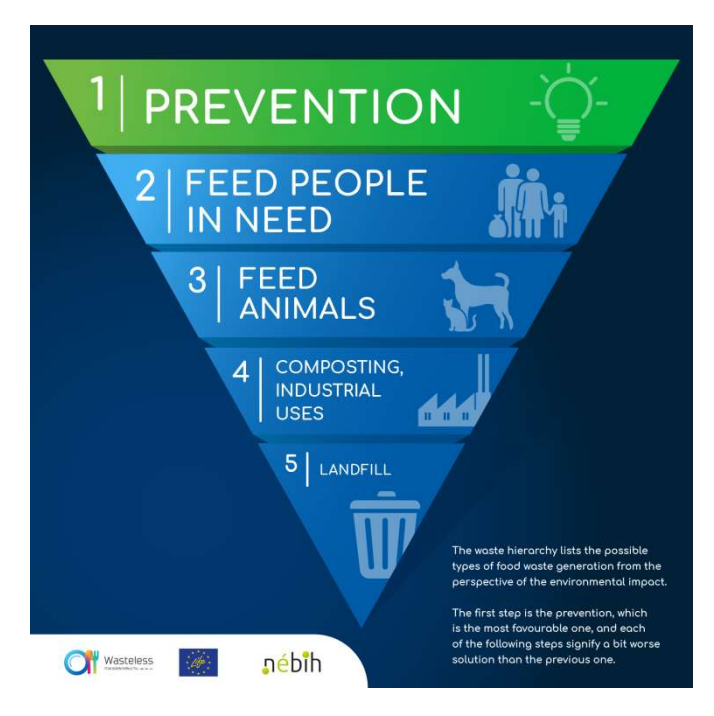
Figure 2. Waste Hierarchy